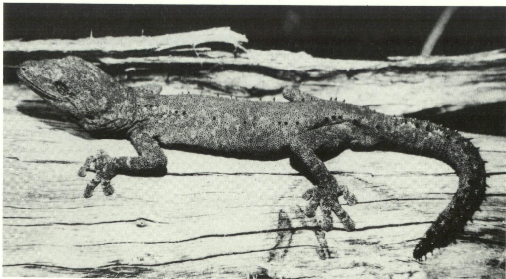
Figure 3 A Diplodactylus spinigerus inornatus from 10 km E Esperance