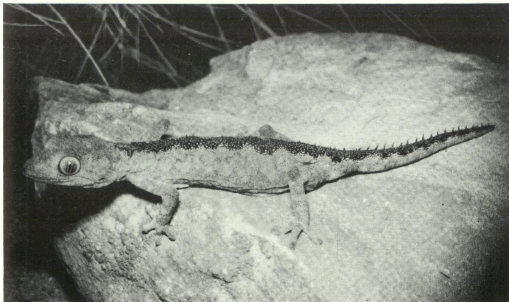
Figure 2 A Diplodactylus spinigerus spinigerus from Green Head, photographed by R.E. Johnstone.